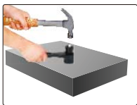
hammer impact to apply test force